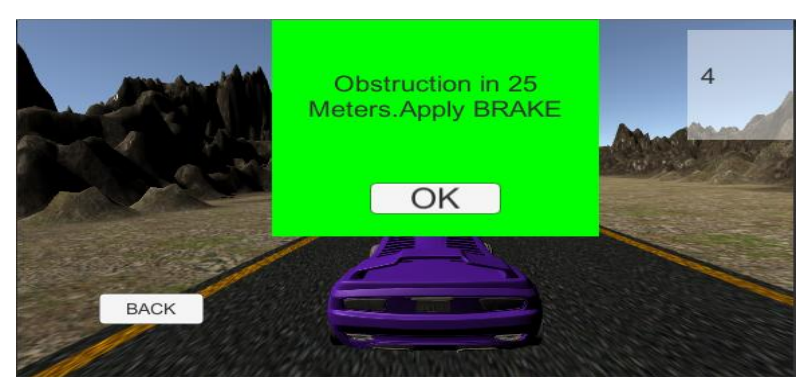
Fig. 4Low level Prompter appears at a distance of 25 meters from static object