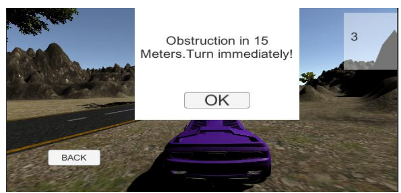
Fig. 5 Mid level prompter appears at 15meters from object