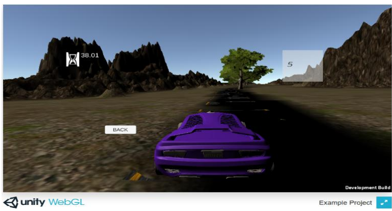
Fig. 3 System starts in static environment with counter 5