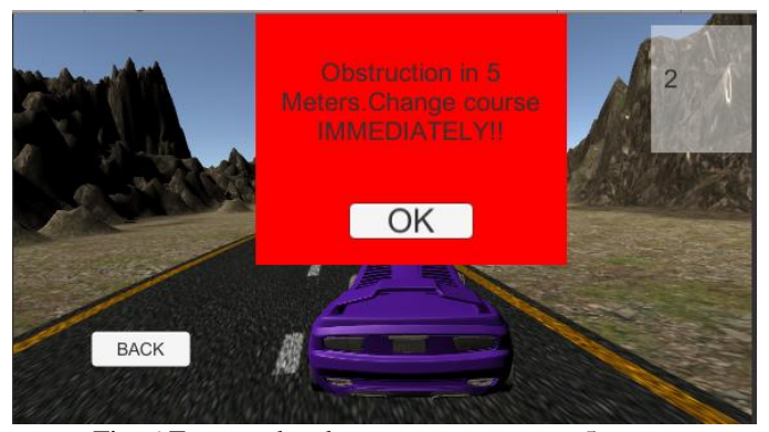
Fig. 6 Extreme level prompter appears at 5meters